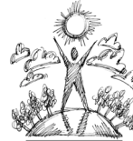
GROUNDS for CREATION

Events during my time here but especially during the past two months have made me reconsider my responsibilities that I have or will accept.